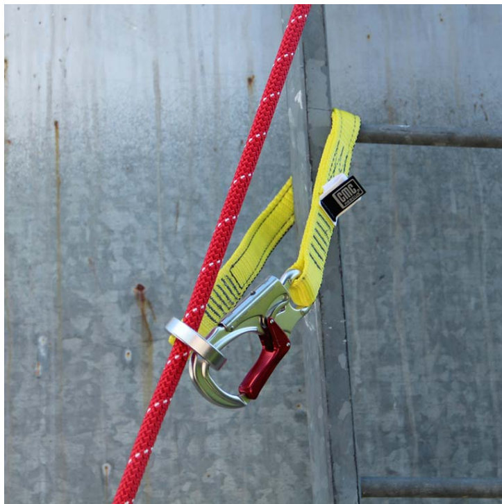
Wrap the lanyard around the structure and connect the carabiner into the ring.

As the leader ascends the tower, an Azzard is wrapped around the main member at the corner just above the metal lacing. Always connect the carabiner into the ring as shown, not around the web. Allow for placement of Azzards at maximum one-meter intervals up the structure. Because the fall factor is greater when the leader is close to the ground the third Azzard is placed \frac{1}{2} meter above the second, and the fourth is placed \frac{1}{2} meter above the third. This also helps to prevent the leader from hitting the ground if he falls near the start of the climb.